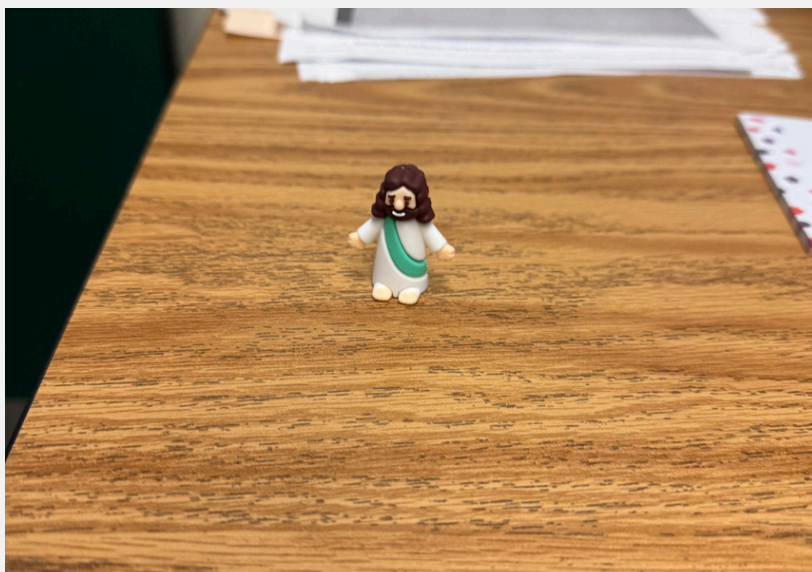
Actual photo of Jesus statue in story