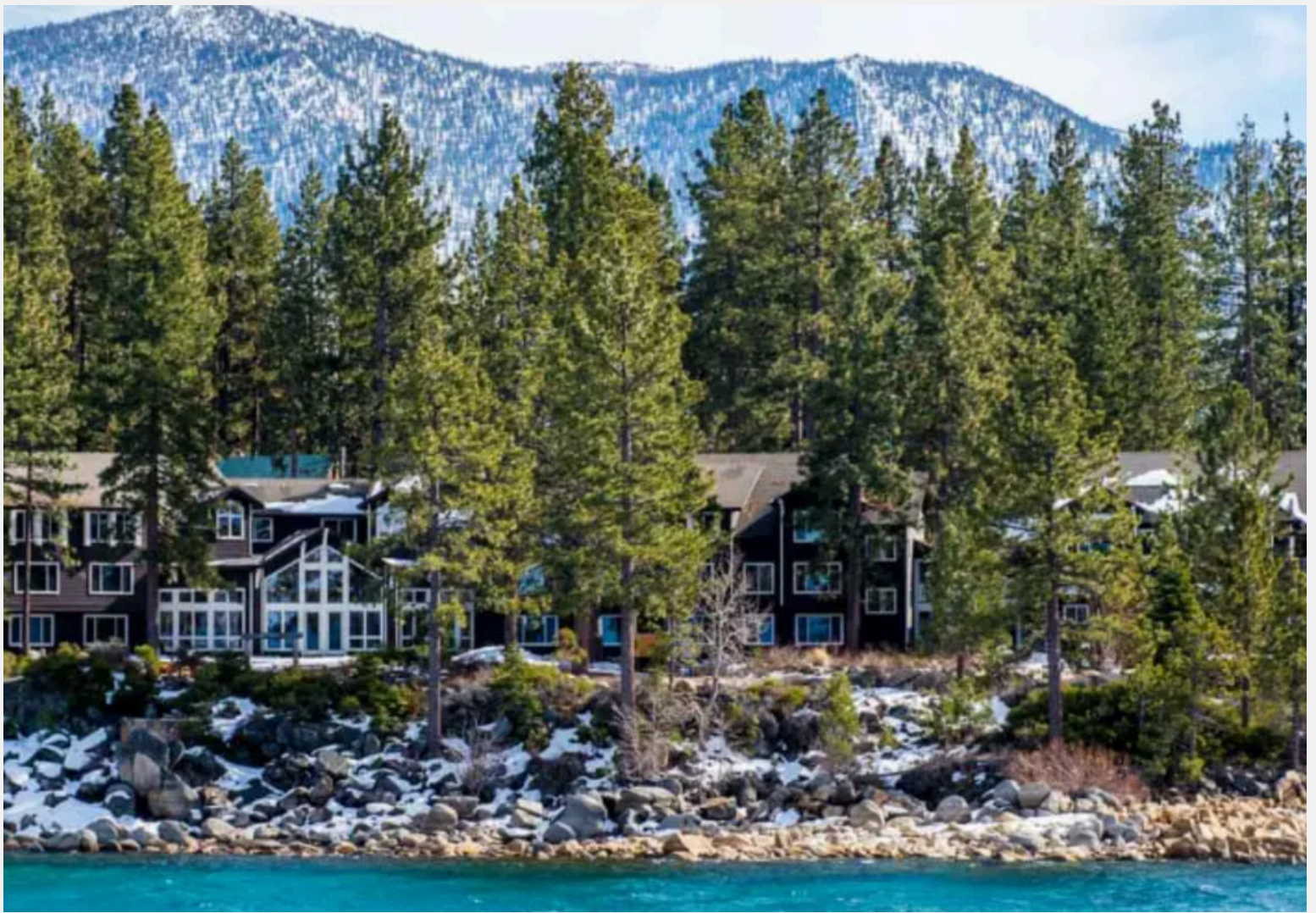
Photo of Zephyr Point in Tahoe